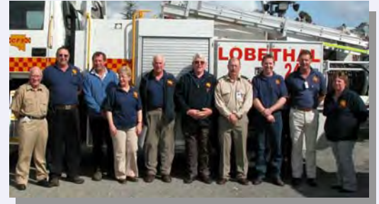
Lobethal CFS Life Members and service award recipients.