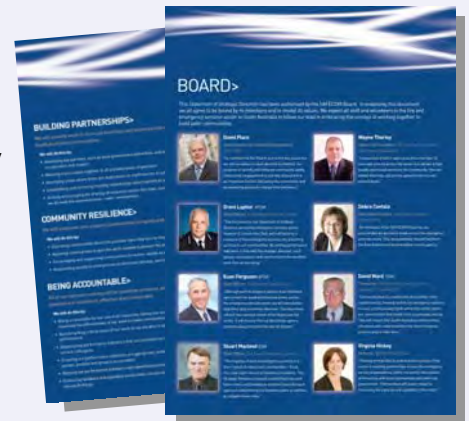
Pages from the sector's Strategic Directions.

Within the sector there are many excellent examples of work being carried out to engage and educate communities to enhance their safety. There is the CFS Bushfire Ready Program, the Juvenile Fire Lighters Intervention Program (JFLIP) of the MFS and emergency management activities of the SES involving schools and community groups.