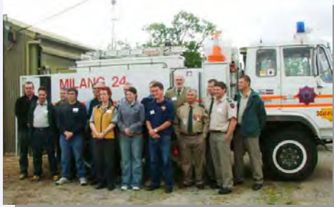
Past and present CFS volunteers gather to celebrate CFS Milang's 60th anniversary.