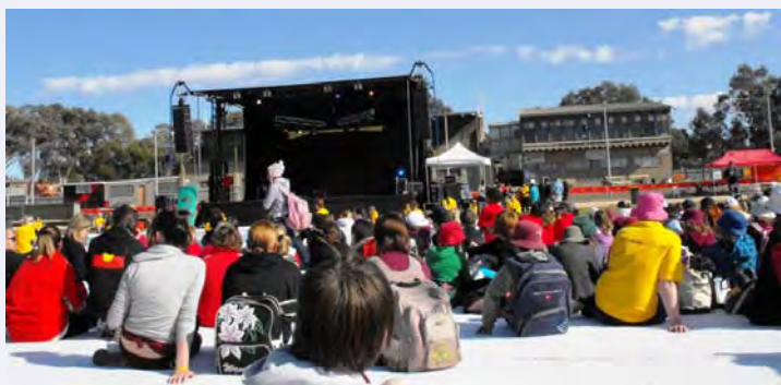
Over 700 students from around the state attended the Vibe Alive Festival in Pt Augusta.

The festival also provided an excellent opportunity for secondary school students to explore potential career prospects with representatives from a wide range of industries, including the emergency services sector, participating in a careers expo. Included with the industry displays was a showcase on a career as a firefighter.