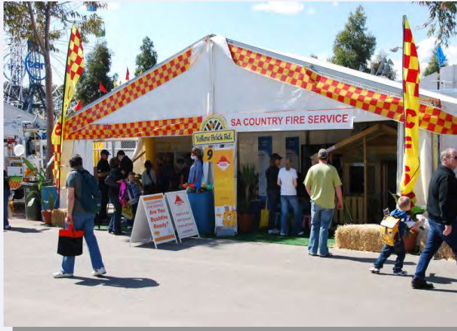
The public enjoys the CFS stand at the Royal Adelaide Show.

Their role was two-fold during the show's nine days, firstly providing reconnaissance, search and rescue, and immediate assistance within the disaster and major emergency area. Secondly, the SES provided daily assistance to SA Police in the search for lost persons and to St Johns with first aid response.