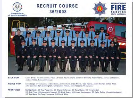
Congratulations to the 18 recruits who graduated on 19 September.

Nobuyuki is currently located at the MFS Prospect Station.