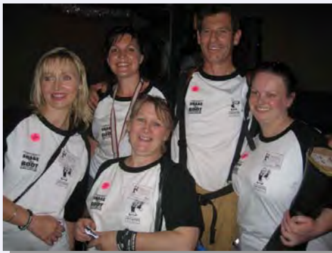
Volunteers and staff enjoy a past 'Shake the Boot' campaign.

Firefighters and volunteers will be hitting pubs across the state during November to raise money for both the Newland Ward at the Women's and Children's Hospital, and local hospitals and charities in regional areas.