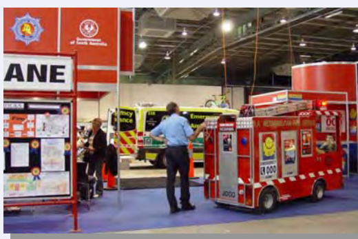
The MFS display at the Royal Adelaide Show.