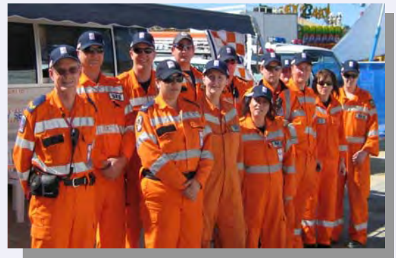
SES volunteers and staff on hand at the show.

The SES had a strong team of 68 volunteers and staff in attendance to support the Adelaide Showground Emergency Response Plan.