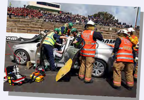
Emergency service crews participate in the road crash rescue exercise as part of the event.

The thousands of students who attended were able to speak with representatives from each of the ESOs about drugs, alcohol and other contributing factors to poor driving.