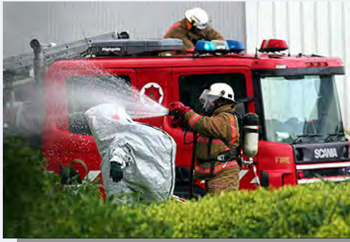
A MFS firefighter is decontaminated at the scene of the HAZMAT incident in Salisbury South.