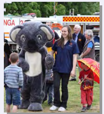
Smokey the Koala celebrates at Willunga CFS.