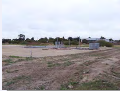
Left: 2004 – Preparation for construction of our structural collapse training site

The materials and site ready for construction to begin. This began with the onsite construction of the tower (tilt up) complete with sloping floors. Once this was completed, the rest of the 'collapsed building' was placed onsite and surrounded by approximately 500 tonne of rubble (damaged pavers). The site is based on a multiplex structure with commercial, residential, car park and office areas.