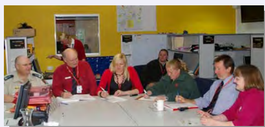
Some of the 'Exercise Team Spirit' participants working hard in the CFS State Coordination Centre.