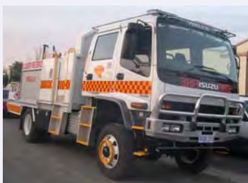
The new 34 appliance for Penola CFS.