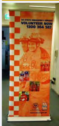
SES pull up sign.

http://abc.net.au/local/stories/2008/09/22/2371169.htm?site=adelaide