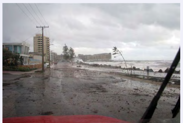
Right: Foreshore at Glenelg North and Adelaide Shores as the high tide and storm peaked.