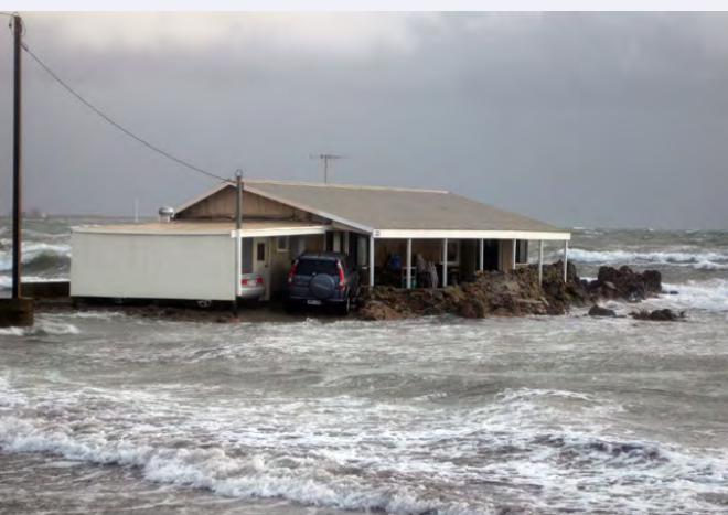
Above: Beach front home at Riley's Point, just north of Wallaroo.