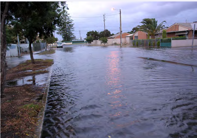
Above: Flooding in and around Fletcher Rd, Birkenhead.