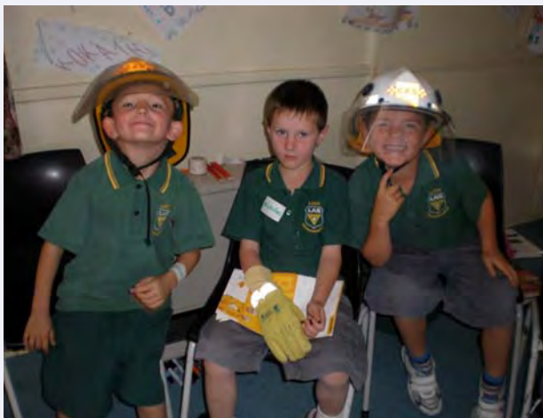
Having fun whilst learning about bushfires.