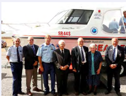
Launch of Sea Rescue 4 at the Copper Coast.