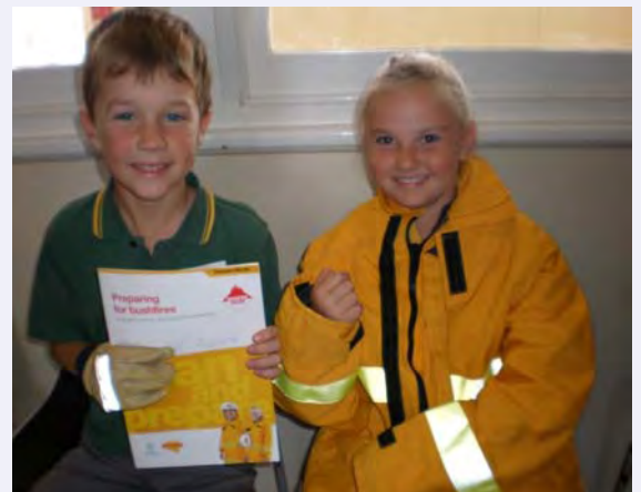
Students with their Bushfire Action Plans.

Reception to Year 3 students learned of the difference between good fires and bad fires with the help of puppets.