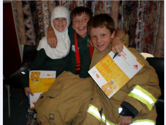
Students enjoy learning about bushfire safety around their homes.