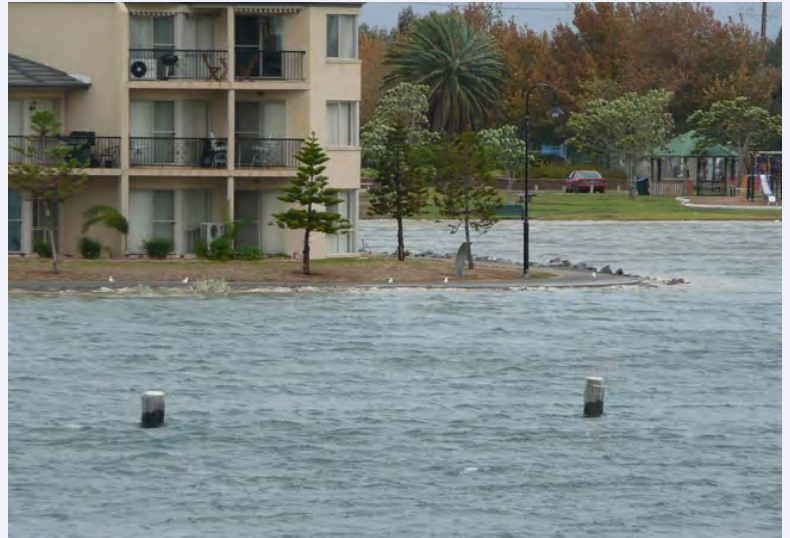
Above: King tide at Port Adelaide, taken from New Port Quays. Below: Car abandoned on Somerton Beach.

SES volunteers were assisted by other emergency services personnel in responding to flooding, storm damage and falling trees.